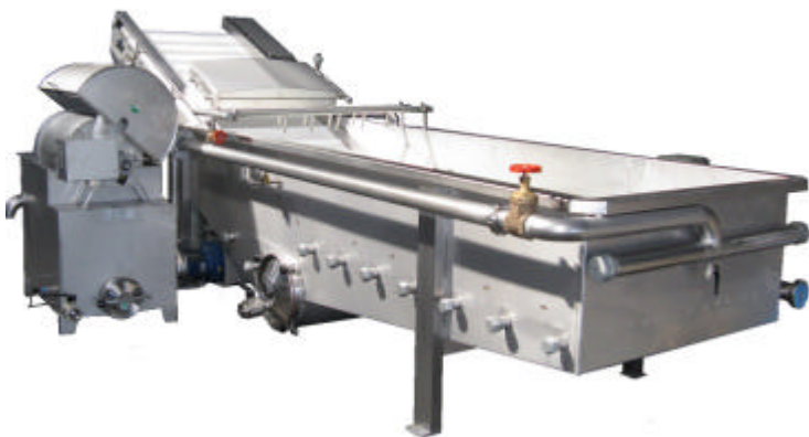
LAVATRICE A BARBOTTAGGIO MOD. L5