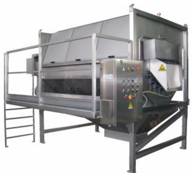
PELATRICE ABRASIVA IN CONTINUO MOD. A80